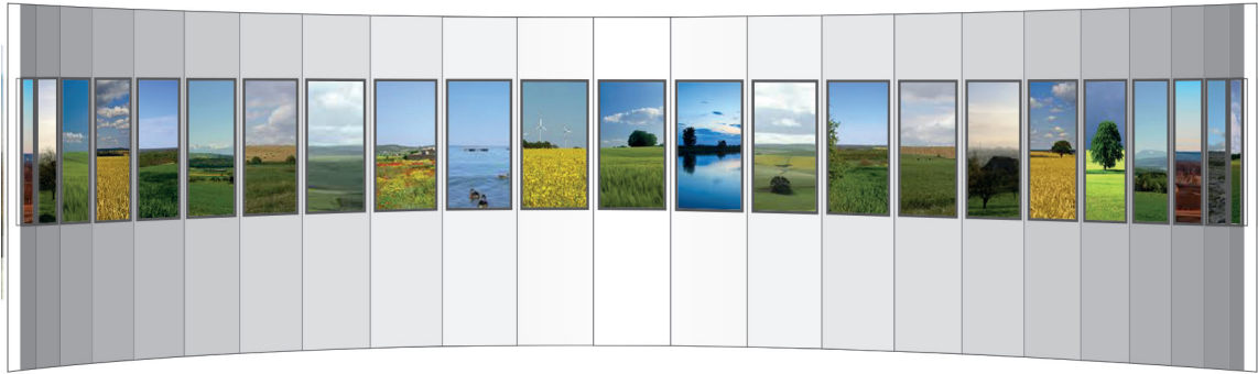
Ansicht vom Kreismittelpunkt / view from the centre