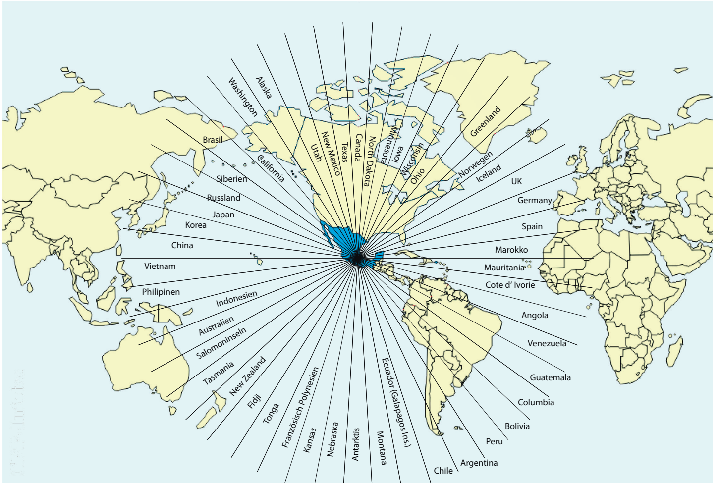
Die Welt aus mexikanischer Sicht Worldmap centred in Mexico

This worldmap shows which countries are positioned where viewed from Mexico. It is obvious that in some directions more then one or no country is situated, there the line was drawn over the poles to countries on the other side of the globe. Specifically viewing north, the USA takes up a lot of space that's why single states of the US were choden. In other directions there is more then on country, there a choice has to be made, or the films play alternating.